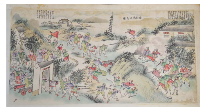
Rare Chinese Opium War Watercolour Album. (circa 1860). AU$95,000