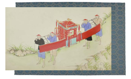
Chinese Watercolour Album [Fifty One Watercolours of Chinese Life and Customs by Unknown Chinese Artist]. (circa 1920). AU$5,500