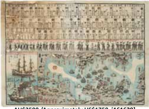
AU$2500 /Approximately US$1750 [161639]

Japanese woodblock kawaraban showing supposed American equivalents of Japanese words. The panel on the left describes the travels of Nagahama Manjiro (also known as John Manjiro), who was rescued by an American ship after being castaway on Torishima Island, he was then taken to the United States.