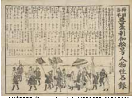
AU$2000 /Approximately US$1400 [161641]

This map of newly created western trading posts at Yokohama (Kanagawa) shows a government organisation called 御運上所 [On unjōsho] located next to foreign settlements. This organisation functioned as the tax office, a customs office, and was also involved in imports and exports.