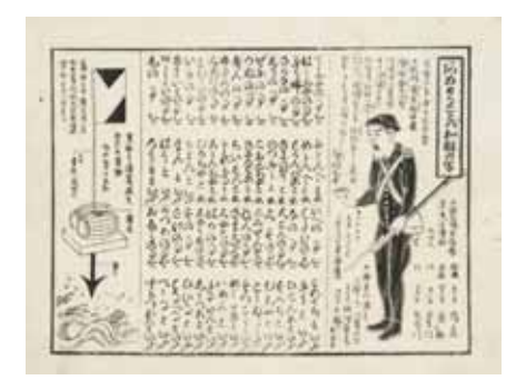
AU$1200 /Approx US$855 [162010]

Print showing a procession of Americans from Perry's second mission to Japan, with a list of the names of ships and of the surnames of prominent crew members from each ship, their rank or position and an approximation of their age.